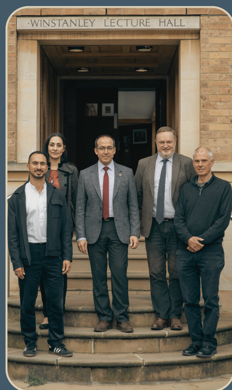
Trinity Lecture Series Winstanley Hall May 2024